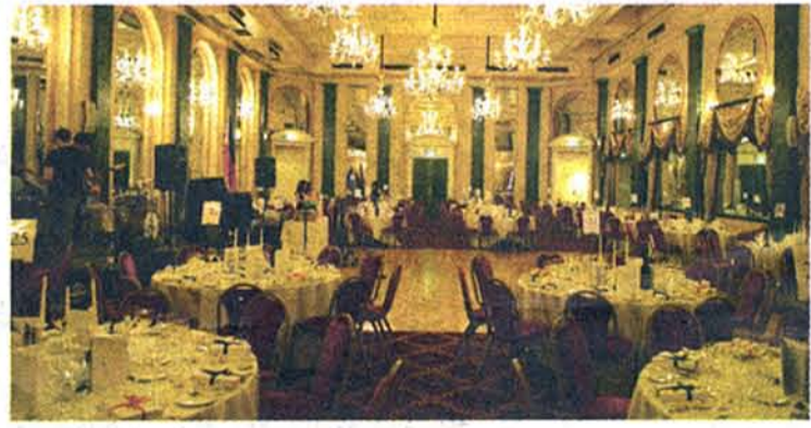
THE ELEGANT Empire Napoleon grand ballroom of the Royal Garden Hotel